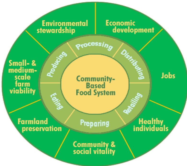
Figure 2: Benefits of sustainable food systems, Source: Chase and Grubinger 2014: 5

The food systems approach thus provides the necessary tools to respond to all the challenges of food security that have been elaborated in section 2 above, which is the production/supply, consumption/wastage and the governance dimensions. The next level of analysis is the place of law and policy in the design and development of sustainable food systems.